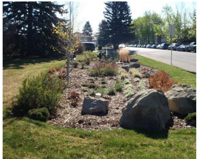
Figure 2: Winston Heights Mountview Rain Garden