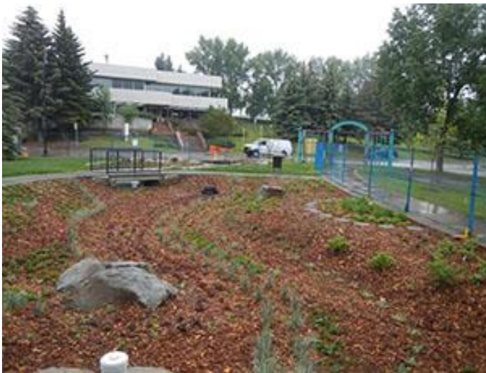
Figure 1: Bridgeland / Riverside Rain Garden

Figures 1 & 2 provide examples of effective Green Infrastructure Designs.