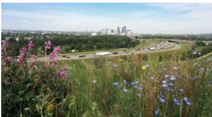
Figure 3: Native vegetation such as vetch, blue flax, and a variety of grasses grow in Calgary

In Calgary's climate, sod / turf grass requires continuous maintenance and irrigation to keep it attractive aesthetically. Limiting the use of sod / turf grass and prioritizing other vegetation, native grasses and ground-coverage, such as mulch and crushed rock, can reduce water use, reduce maintenance, improve overall year-round aesthetics, and promote biodiversity.