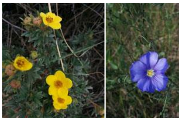
Figure 4: Shrubby cinquefoil and blue flax are native wildflowers being planted as part of the naturalization initiative