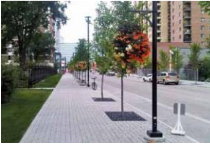
Figure 5: Wide sidewalks and physical separation / barriers between pedestrians and automobiles in Calgary's East Village