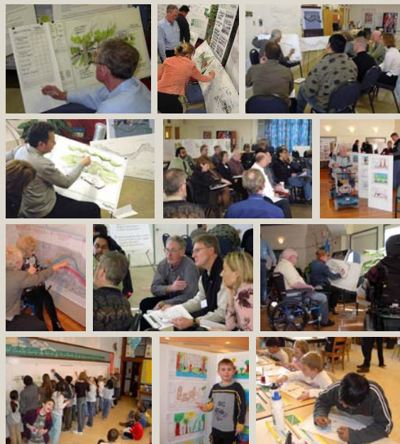
Many Calgarians have already had an opportunity to participate in this project

The landscape of the Memorial Drive corridor is also experiential- inviting Calgarians to experience the poetics of the wind on the grass, the movement of water, the dance of city lights.